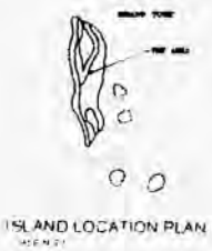
ISLAND LOCATION PLAN