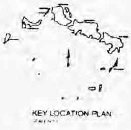
KEY LOCATION PLAN